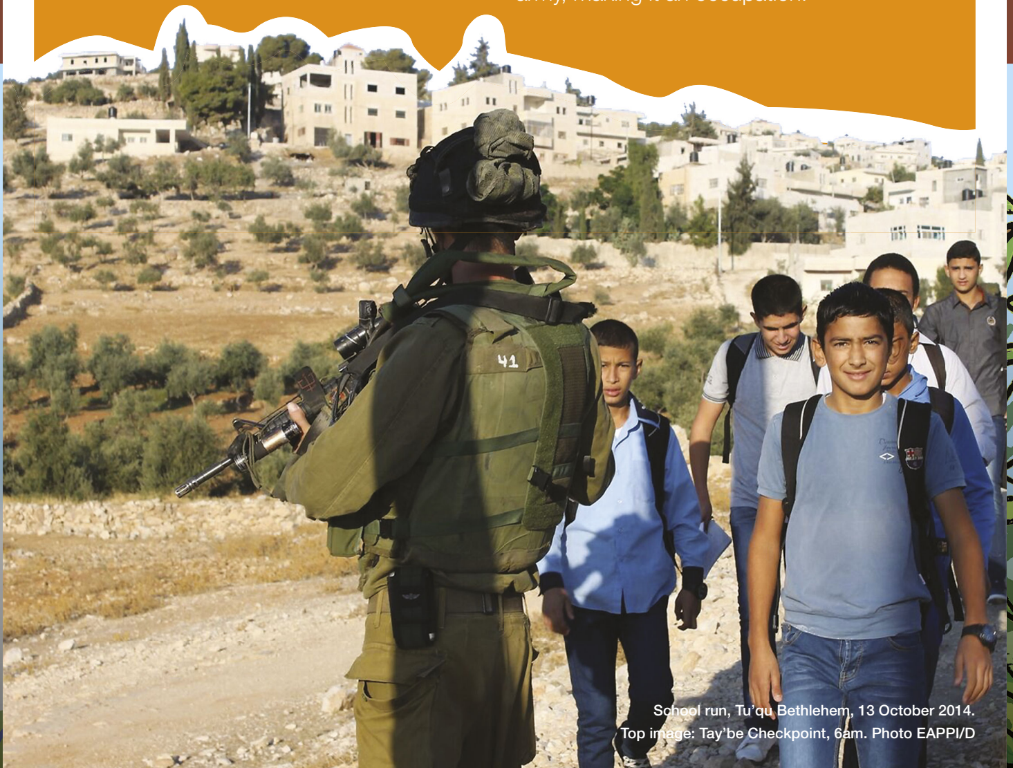
School run, Tu’qu Bethlehem, 13 October 2014.

Gaza and the West Bank, including East Jerusalem, are under the control of Israel’s army, making it an occupation.